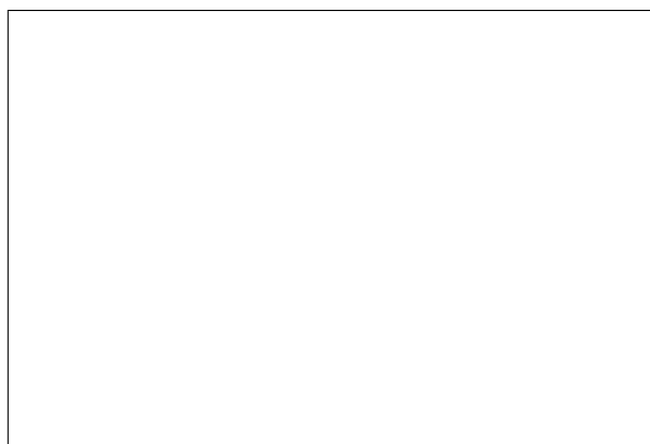
Figure 1. Example of caption. It is set in Roman so that mathematics (always set in Roman: B \sin A = A \sin B ) may be included without an ugly clash.

When citing a multi-author paper, you may save space by using “et alia”, shortened to “ et al. ” (not “ et. al. ” as “ et ” is a complete word.) However, use it only when there are three or more authors. Thus, the following is correct: “Frobination has been trendy lately. It was introduced by Alpher [1], and subsequently developed by Alpher and Fotheringham-Smythe [2], and Alpher et al. [3].”